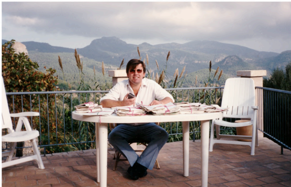
At work on the terrace of Finca Conques in 1992