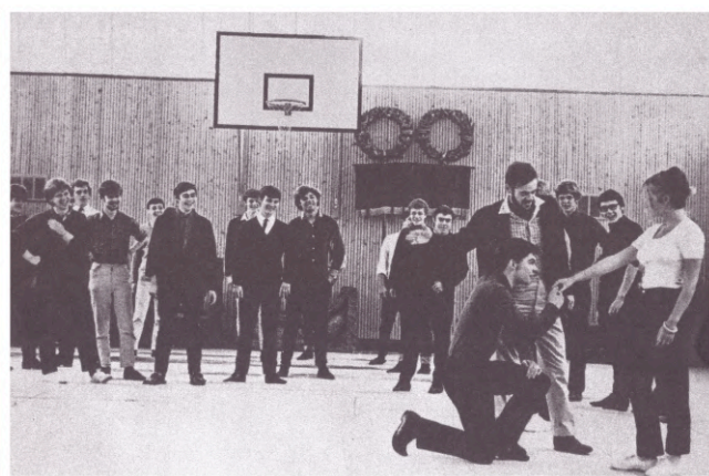
Kneeling before Helen Mirren in a rehearsal of Antony and Cleopatra